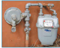
Single-unit residential meter