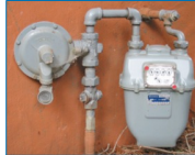
Single-unit residential meter