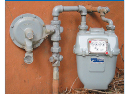
Single-unit residential meter