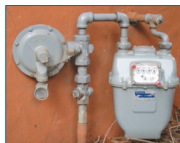
Single-unit residential meter